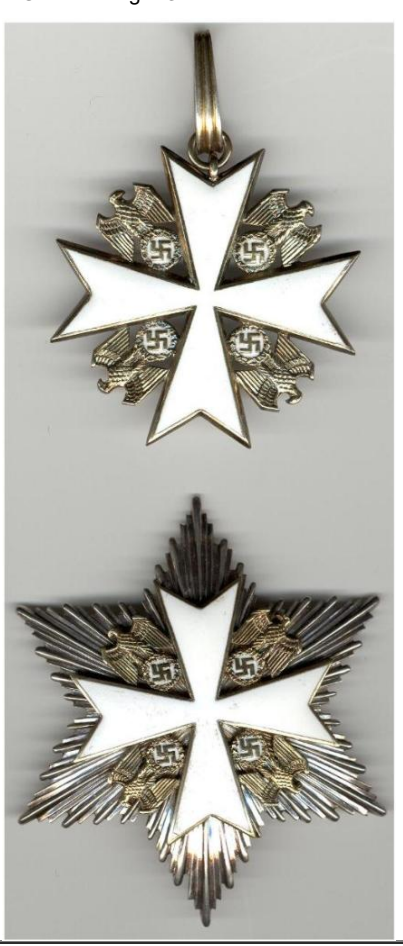
"Verdienstkreuz des Deutschen Adlerordens mit dem Stern" Merit Cross of the German Eagle Order with the Star This set was only awarded between May 1, 1937, until April 20, 1939. The so called 1st model is extremely rare. Both pieces are marked "800", the star also shows the punch mark "Silber"