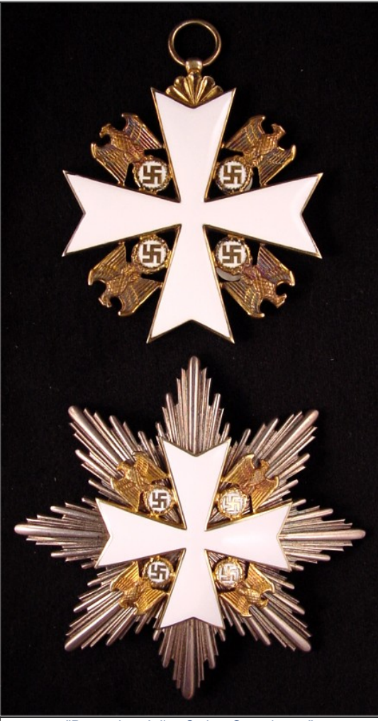
"Deutscher Adler Orden Grosskreuz" German Eagle Order Grand Cross

Check out those pretty pieces (click on picture for an enlarged image):