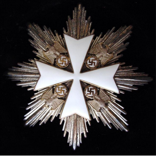
"Deutscher Adler Orden 1.Klasse" German Eagle Order 1st Class Only awarded between December 27, 1943 to the end. The star shows the marks "900" on its needle, the cross The latest addition to the order is quite rare. The Eagles are silver with a golden rim on cross and star, despite to being completely gilt as on all other grades. The star shows the marks "900 21" on its needle.